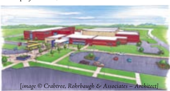
^ CLARKE COUNTY HIGH SCHOOL BERRYVILLE, VA

architect: Spectrum Design, PC; size: 110,000 SF; project cost: $15.6 million