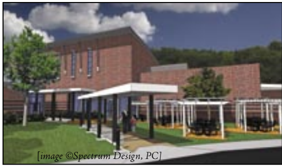
↑ PRICE'S FORK ELEMENTARY SCHOOL. MONTGOMERY COUNTY, VA

architect: Spectrum Design, PC; size: 110,000 SF; project cost: $15.6 million