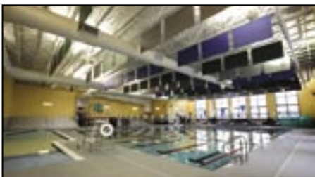
^ MANASSAS PARK COMMUNITY CENTER, MANASSAS PARK, VA

The new facility includes an NCAA short course competition certified indoor pool, two state-of-the-art gymnasiums, an event hall, 11 multi-purpose rooms and a dedicated teen center. Architect for the project was OWPR, Inc. of Blacksburg, VA.