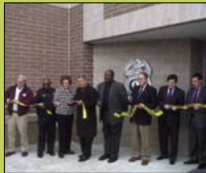
▲ ROANOKE POLICE ACADEMY, ROANOKE, VA

* The Leadership in Energy and Environmental Design (LEED®) Green Building Rating System, developed by the U.S. Green Building Council (USGBC), provides a suite of standards for environmentally sustainable construction.