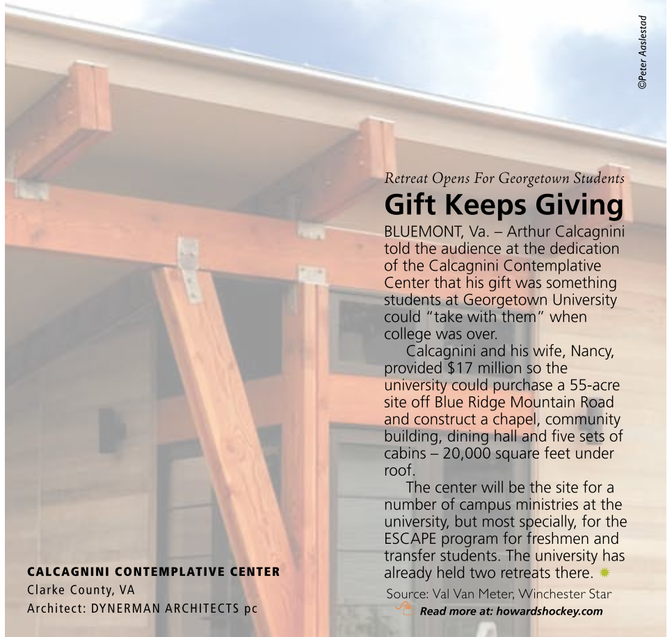
CALCAGNINI CONTEMPLATIVE CENTER Clarke County, VA Architect: DYNERMAN ARCHITECTS pc