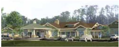
FRIENDSHIP RETIREMENT COMMUNITY Roanoke, VA Architect: Freeman White Size: 72,000 SF