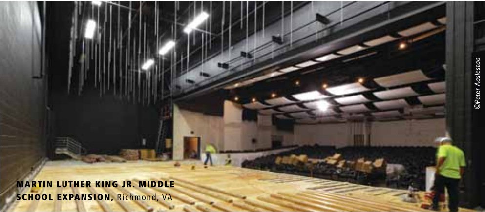
MARTIN LUTHER KING JR. MIDDLE SCHOOL EXPANSION , Richmond, VA