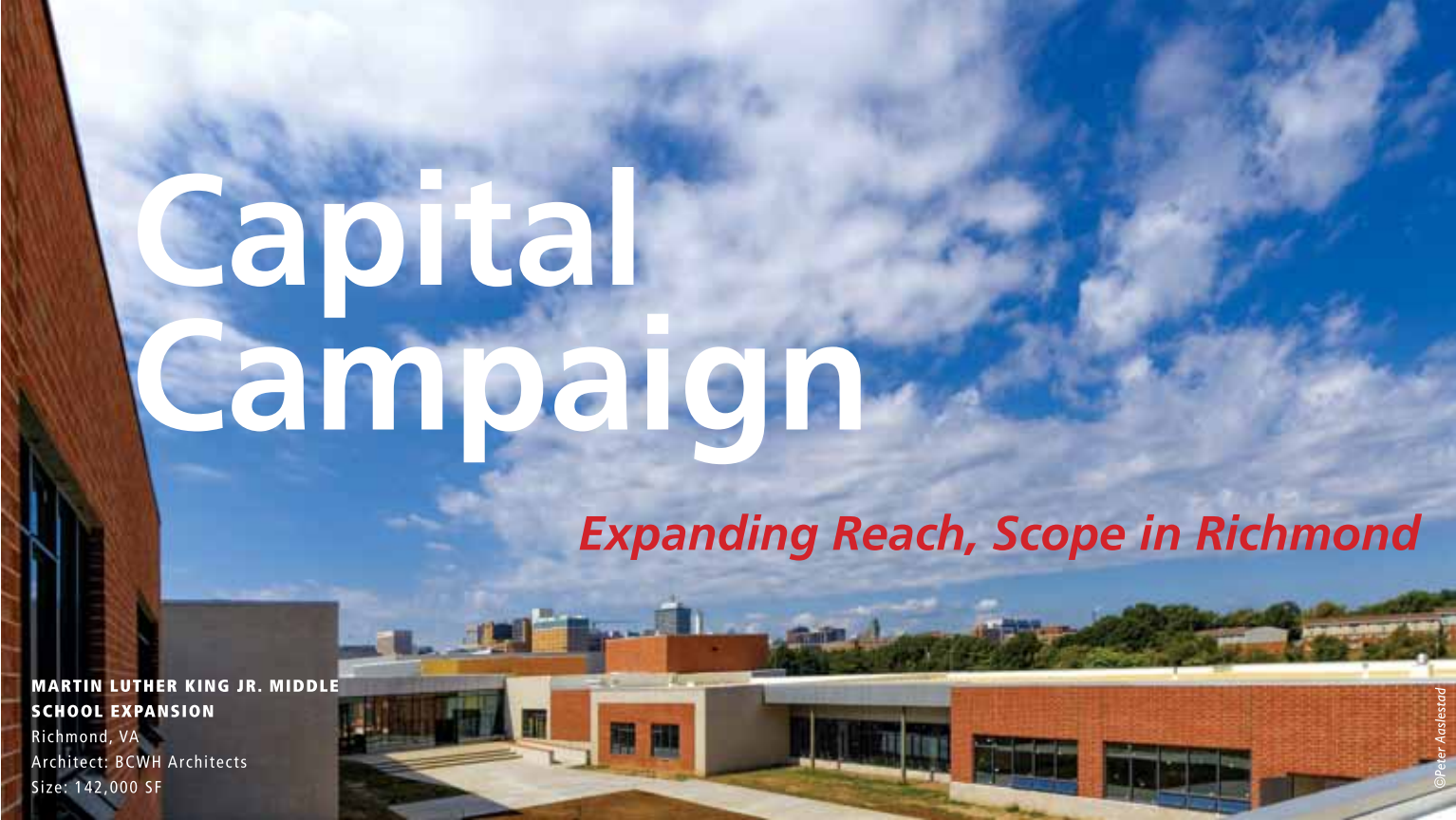
MARTIN LUTHER KING JR. MIDDLE SCHOOL EXPANSION Richmond, VA Architect: BCWH Architects Size: 142,000 SF