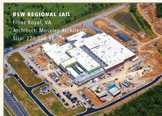
RSW REGIONAL JAIL Front Royal, VA Architect: Moseley Architects Size: 270,000 SF