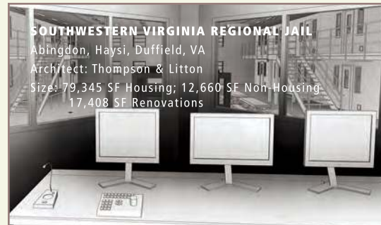
SOUTHWESTERN VIRGINIA REGIONAL JAIL Abingdon, Haysi, Duffield, VA Architect: Thompson & Litton Size: 79,345 SF Housing; 12,660 SF Non-Housing; 17,408 SF Renovations