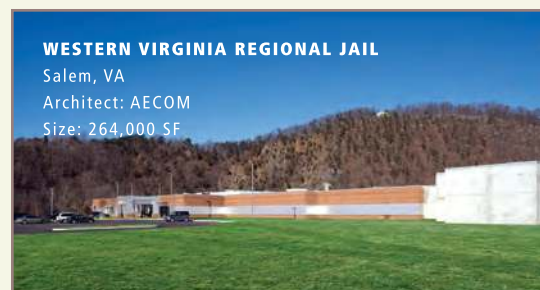
WESTERN VIRGINIA REGIONAL JAIL Salem, VA Architect: AECOM Size: 264,000 SF