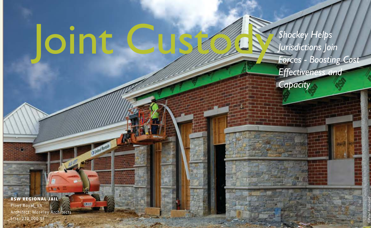
RSW REGIONAL JAIL Front Royal, VA Architect: Moseley Architects Size: 270,000 SF

Shockey Helps Jurisdictions Join Forces - Boosting Cost Effectiveness and Capacity