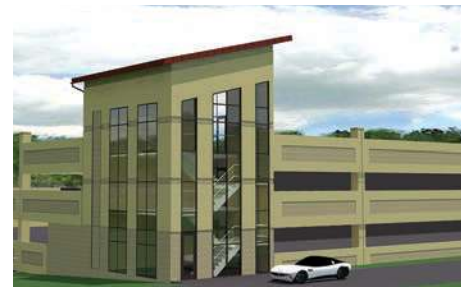
National Conference Center Parking Structure Lansdowne, VA Architect: Design Concepts