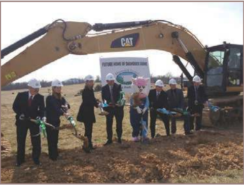
SHAMROCK FARMS GROUNDBREAKING Augusta County, VA Architect: Deutsch Architecture Size: 170,000 SF

PHOENIX, Ariz. – Howard Shockey & Sons has been selected to build a new $50 million plant for Shamrock Farms, one of the largest family-owned-and-operated dairies in the U.S. The 170,000-square-foot advanced manufacturing facility is located at Mill Place Commerce Park in Augusta County, VA.