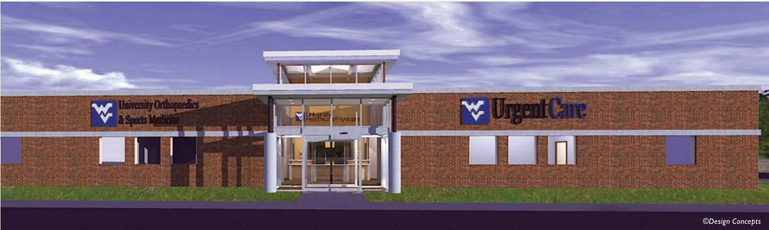
UNIVERSITY HEALTHCARE PHYSICIANS MEDICAL OFFICE BUILDING Charles Town, WV Architect: Design Concepts Size: 11,200 SF

Offering better access for patients, a single-story medical office building will house two existing medical practices, WVU Urgent Care and University Orthopaedics and Sports Medicine. The hospital also plans to move its physical therapy services to the new building. The $3.4 million project is Shockey’s third partnership with University Healthcare. Previous work included capital projects at both Jefferson Medical Center and Berkeley Medical Center. Source: The Journal / Jenni Vincent