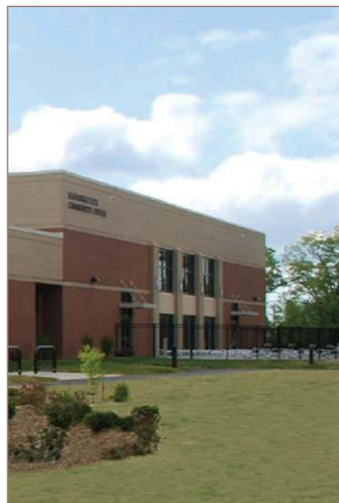
MANASSAS PARK COMMUNITY CENTER Manassas Park, VA Architect: OWPR, Inc. Size: 79,280 SF