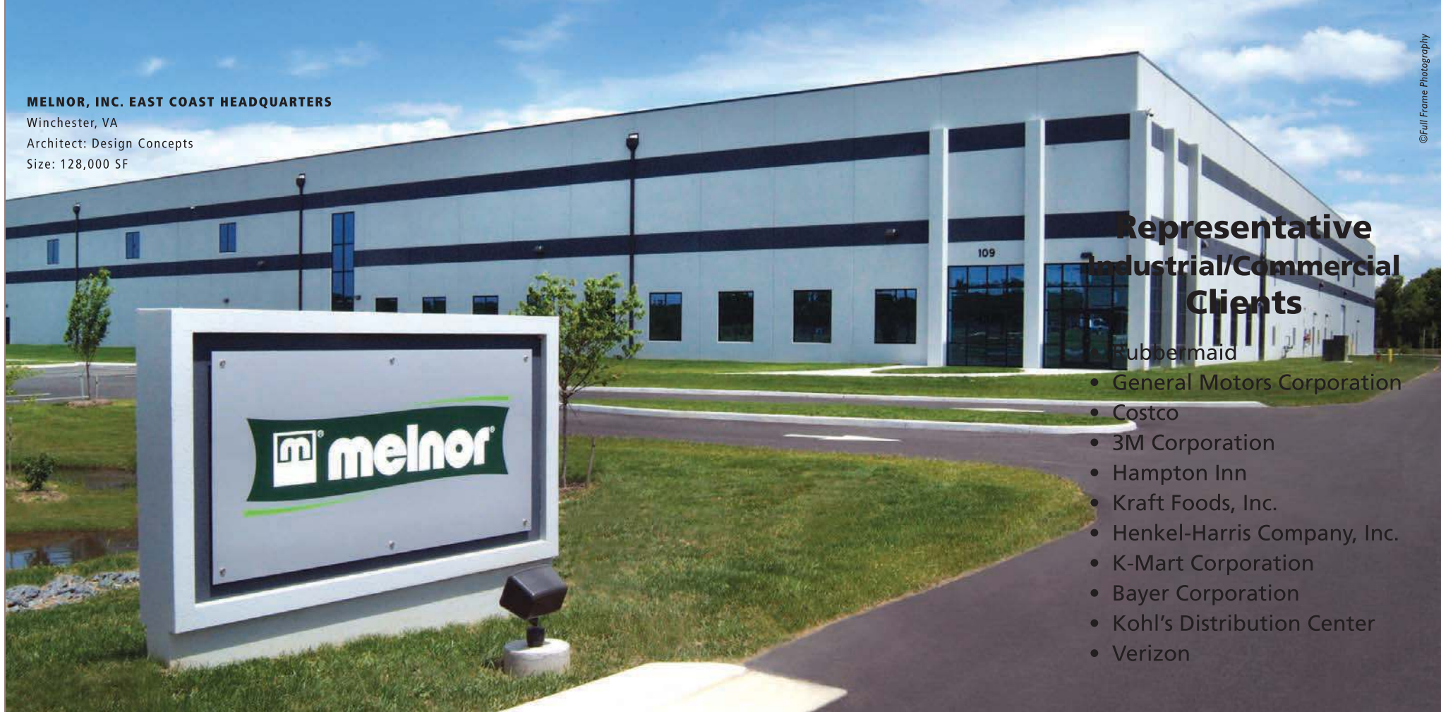
MELNOR, INC. EAST COAST HEADQUARTERS Winchester, VA Architect: Design Concepts Size: 128,000 SF

The architect on the project is Design Concepts of Winchester.