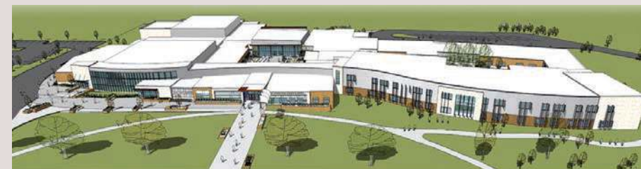
MARTIN LUTHER KING JR. MIDDLE SCHOOL, Richmond, VA